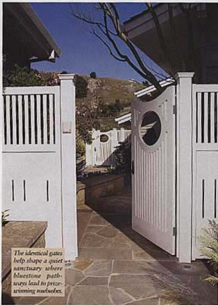
The identical gates help shape a quiet sanctuary where bluestone pathways lead to prize-winning roses.