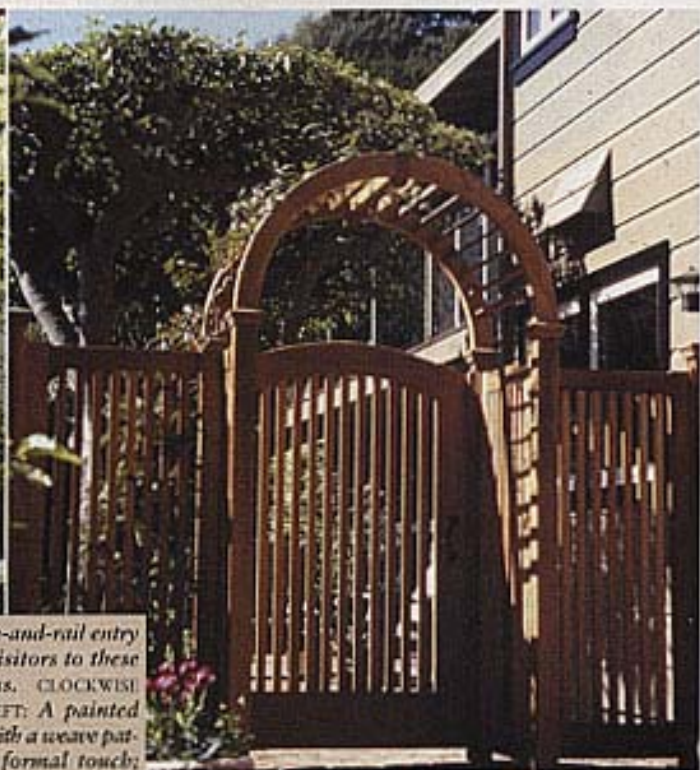
Different stile-and-rail entry gates greet visitors to these four gardens. CLOCKWISE FROM TOP LEFT: A painted double gate with a weave pattern adds a formal touch; an arched arbor encourages climbing vines; a green painted gate and fence allow a peek at the garden beyond; a gray stained wooden gate has an informal feel.